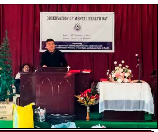
ARTICLE 27 (UNCRC). YOU SHOULD HAVETHE CONDITIONS YOU NEED for your physical, mental, spiritual, moral and social development. If your family is unable to provide these conditions, the government should help - particularly with nutrition, clothing and housing.